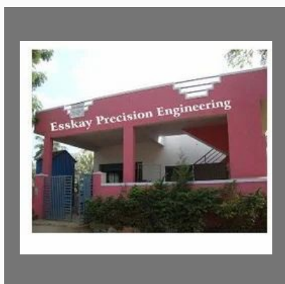
CNC Job Works