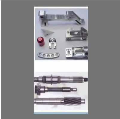
Esskay Precision Engineering Products