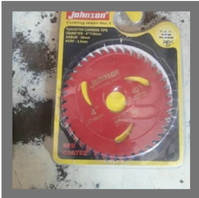
Circular Cutting Blade