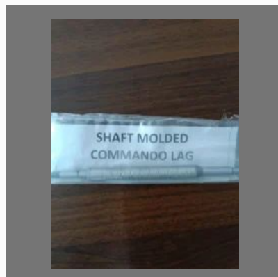
Shaft Molded Commando Leg