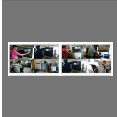
CNC Turning Comopnents