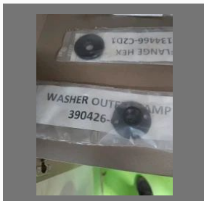
Washer Outer Lamp